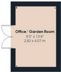
Ground Floor Building 3