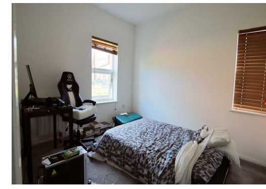
63 Shaftesbury Road, Reading, Reading, Berkshire, RG30 2QJ £1,100 PCM