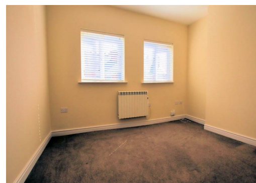
Top floor, 10 Richmond Road, Reading, Reading, Berkshire, RG30 2SP £1,000 Per calendar month