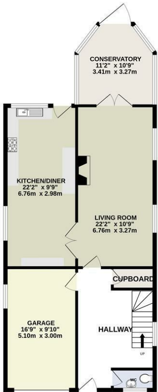
GROUND FLOOR 899 sq.ft. (83.5 sq.m.) approx.