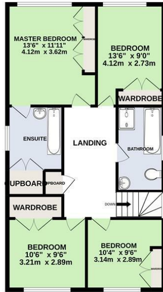
1ST FLOOR 791 sq.ft. (73.5 sq.m.) approx.