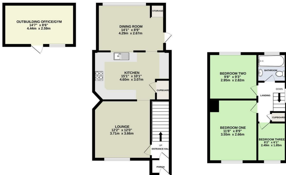
1ST FLOOR 351 sq.ft. (32.6 sq.m.) approx.

TOTAL FLOOR AREA: 969 sq.ft. (90.0 sq.m.) approx. Whilst every attempt has been made to ensure the accuracy of the floorplan contained here, measurements of doors, windows, rooms and any other items are approximate and no responsibility is taken for any error, omission or mis-statement. This plan is for illustrative purposes only and should be used as such by any prospective purchaser. The services, systems and appliances shown have not been tested and no guarantee as to their operability or efficiency can be given. Made with Metropix ©2022