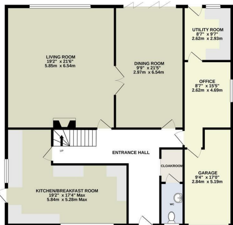
GROUND FLOOR 1529 sq.ft. (142.1 sq.m.) approx.