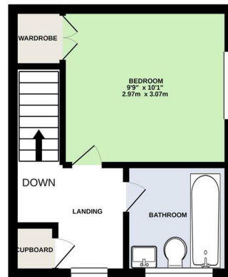
1ST FLOOR 219 sq.ft. (20.4 sq.m.) approx.