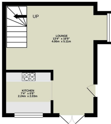
GROUND FLOOR 228 sq.ft. (21.2 sq.m.) approx.