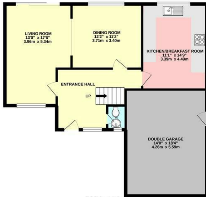
1ST FLOOR 716 sq.ft. (66.5 sq.m.) approx.